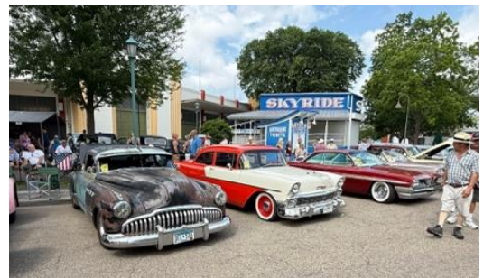
Back to the Fifties 2025

Back to the Fifties Weekend June 19-21, 2026 At the State Fairgrounds