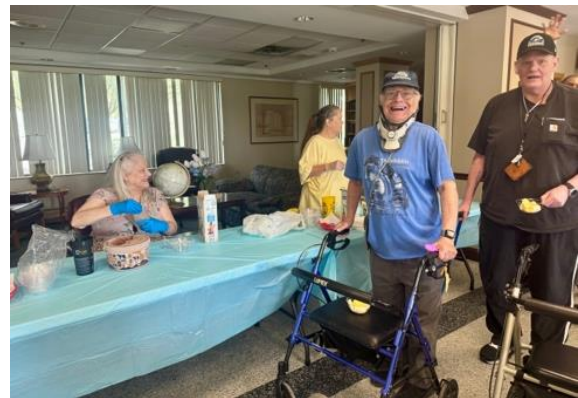
All in all, a good time was had by everyone who attended.