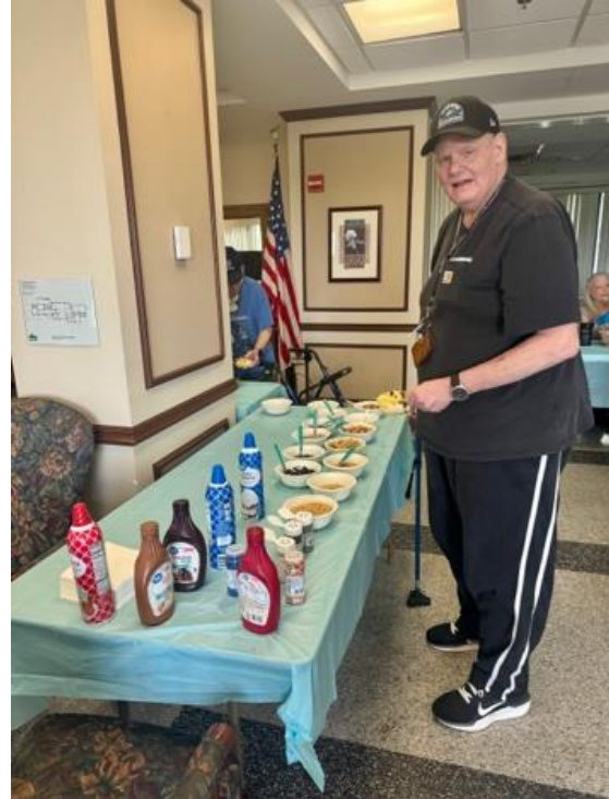
Residents enjoyed the fellowship time with their neighbors, getting recognized for what they do around the hi-rise, and making their own ice cream treat.

This issue we'll focus on the Volunteer Appreciation event at Cleveland Hi-Rise. The celebration was held on April 23 rd and was an ice cream social featuring a make your own ice cream sundae bar.