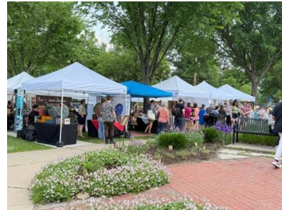
St. Anthony Park Arts Festival

Here is a list of some free and low-cost events happening in the Twin Cities this summer.