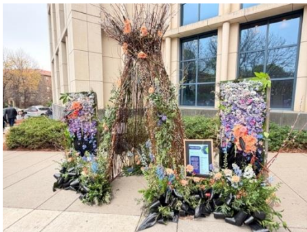
Art in Bloom at MIA

Spring is also when annual housekeeping inspections start so it's a great time for cleaning and organizing and getting a fresh outlook on things.