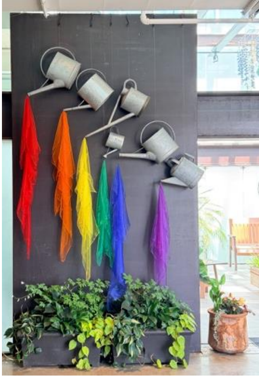
Another way of looking at color in the garden. Art piece at Como Conservator