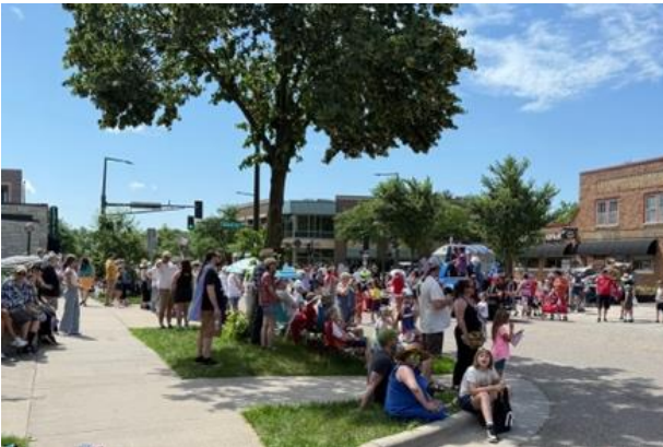
4th in the park parade 2025

IndiaFest August 15, 2026 Minnesota State Capitol