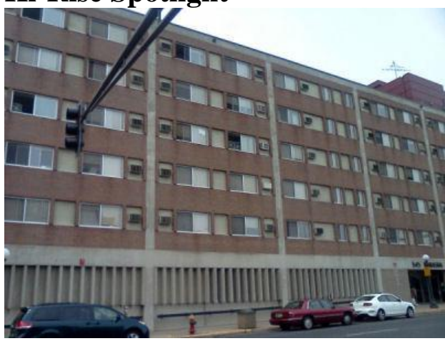
This month: Wabasha By Ruby Steward

On our tour of hi-rises, Wabasha hi-rise is the next in line. Wabasha hi-rise is located in downtown St. Paul. It is a six story brick building constructed in 1969 with efficiency as well as one bedroom apartments. The community room was remodeled in 1996.