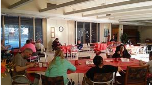
These pictures show some of the food, decorations, and people at the Chinese New Year event at Seal on February 27 th .